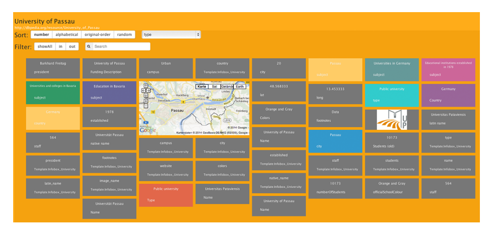
Fig. 1. Viewing an example entity with enriched information and ontology templating

The user interface of balloon Synopsis is inspired by modern operation systems and design trends. A main principle is to focus on the content and direct relationship between semantic entities rather than showing a global and complex context. Semantic entities (graph nodes) are considered as autonomous tiles, containing information about the entity itself. Clicking on a tile gives the user the possibility to view the represented resource in detail, leading to a new node-centric overlay. Figure 1 shows a screenshot of a detail view. All related information or entities are again arranged as clickable tiles, allowing an iteratively browsing trough the data.