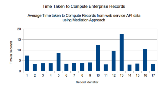
Fig. 3. DaWeS: Record Computation Time.